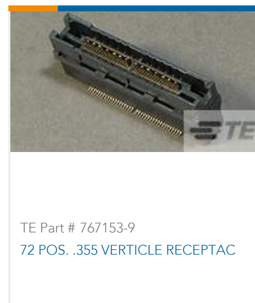
TE Part # 767153-9 72 POS. .355 VERTICLE RECEPTAC