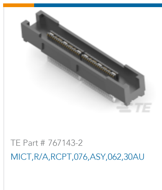
TE Part # 767143-2 MICT,R/A,RCPT,076,ASY,062,30AU