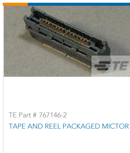
TE Part # 767146-2 TAPE AND REEL PACKAGED MICTOR