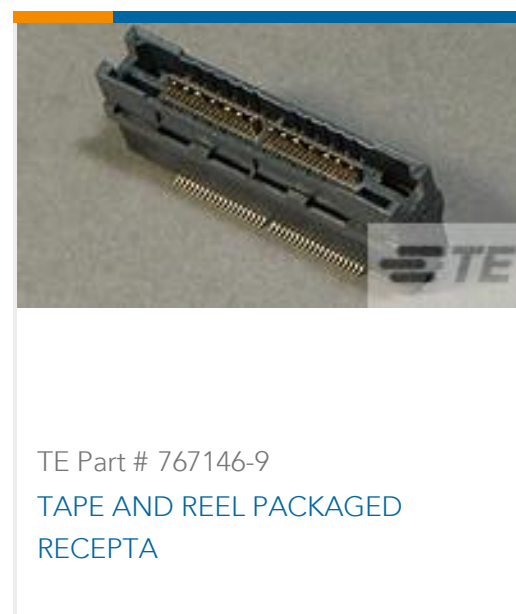
TE Part # 767146-9 TAPE AND REEL PACKAGED RECEPTA